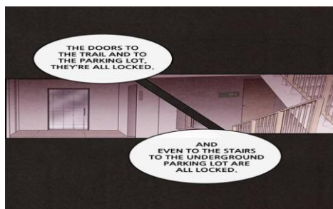
Figure 9. Data 6

eye area, the eyebrows raised, the eyes become alert and focus is further clarified by Eun Yu's body gesture which points at something that makes them curious and her mouth opens as if to take in more. The next step is analyzing the framing technique. The frame takes Eun Yu told something to Sang Wook, so that's focusing on Eun Yu's facial expression and body gesture. The last step is analyzing the communicative act. The verbal sign that found in the Webtoon is the caption in the balloon speech " hey little kid, what's going on? " " the elevator is broken and all entrances of the building are blocked with shutters, " " the security office is locked, and no one is answering, " " besides, the phones... " and " aren't working ". Those sentences are statement and question. We can conclude that they were talking about the broken elevator.