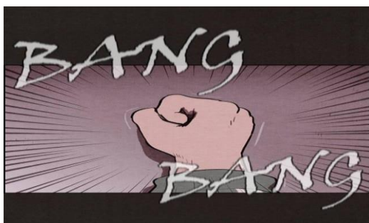
Figure 7. Data 4

The sign used is legisign since the Webtoon shows the meaning through an object by general expression of puzzled. The object can be categorized as icon because icon is a sign which resembles the object, while the character in Webtoon is figurative image and resembles the object, therefore it is an icon. Rheme stands for its object in respect of quality. After identifying the signs, I apply 3 steps of analysis model, among others; the first step is analyzing non-verbal communication legisign . In this webtoon it was analyzed based on According to Joumana Medlej in human anatomy fundamentals series (Envato, 2021), Sang Wook shows puzzled expressions. Puzzled expression here can be seen by his raised eyebrows and a slightly confused expression on his face. This seemed clearer than what he said to Ji Su. Sang Wook looked confused until finally he decided to just tell them to wait in the room. The next step is analyzing the framing technique. The frame takes Sang Wook's face, so that it's focusing on his face or facial expression. The last step is analyzing the communicative act. The verbal sign that found in the Webtoon is the caption in the balloon speech "So you wait here for now". This sentence is a statement. We can conclude that Sang Wook just wants to save them by asking them to stay in the room.