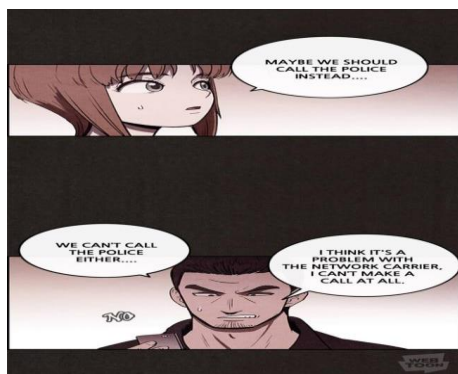
Figure 4. Data 1