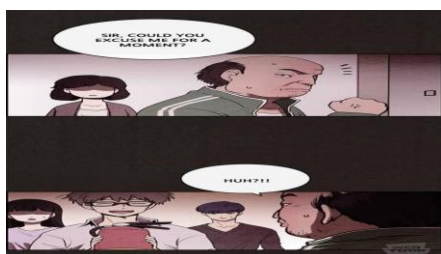
Figure 11. Data 8

The sign used is legisign since the Webtoon shows the meaning through an object by general expression of curious. The object can be categorized as icon because icon is a sign which resembles the object, while the character in Webtoon is figurative image and resembles the object, therefore it is an icon. Rheme stands for its object in respect of quality. After identifying the signs, I apply 3 steps of analysis model, among others; the first step is analyzing non-verbal communication legisign . In this webtoon it was analyzed based on Sang Wook’s body gesture and Hyu Soo’s body gesture. According to Joumana Medlej in human anatomy fundamentals series (Envato, 2021), Hyun Soo shows so-so gesture because he walked casually without any suspicious movements, while Sang Wook and Eun Yu looked curious on Hyun Soo. The next step is analyzing the framing technique. The frame takes Sang Wook and Eun Yu were looking at Hyun Soo. The last step is analyzing the communicative act. The verbal sign that found in the Webtoon is the caption in the balloon speech “ fire extinguisher? ”. This sentence is question. We can conclude that they were wondering why Hyun Soo brought fire extinguisher.