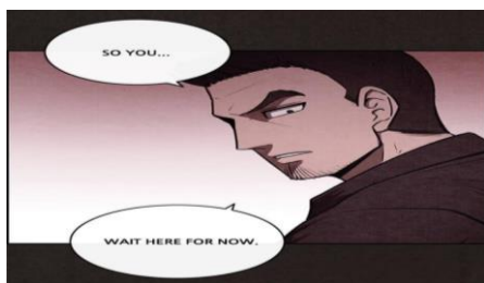
Figure 6. Data 3