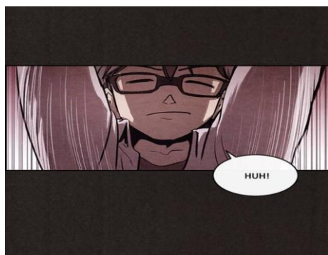
Figure 12. Data 9

because icon is a sign which resembles the object, while the character in Webtoon is figurative image and resembles the object, therefore it is an icon. Rheme stands for its object in respect of quality. After identifying the signs, I apply 3 steps of analysis model, among others; the first step is analyzing non-verbal communication legisign . In this Webtoon it was analyzed based on Hyun Soo's facial expression and an old man's facial expression. According to Joumana Medlej in human anatomy fundamentals series (Envato, 2021), Hyun Soo shows ecstatic expression, it can be seen by his true broad smile, visible teeth that are a strong sign of happiness, but he also looks awkward in front of the old man. While the old man looks upset, it can be seen by the heads of the eyebrows move down, and the jaw is tensed into biting posture that pushes the lower lip forward and makes the mouth curve down. The next step is analyzing the framing technique. The frame takes Hyun Soo smiling awkwardly. The last step is analyzing the communicative act. The verbal sign that found in the Webtoon is the caption in the balloon speech "sir, could you excuse me for a moment?" and "huh?!!". Those sentences are questions. We can conclude that the situation was so awkward and confusing.