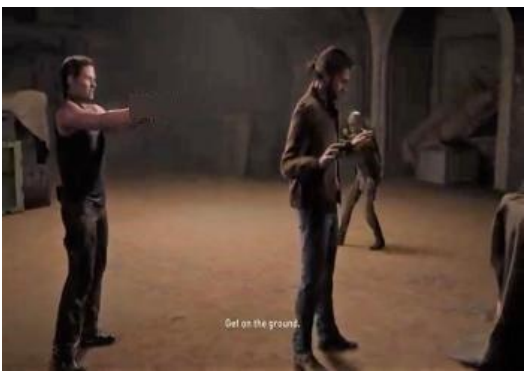
Figure 6. Abby pointing a gun at Tommy