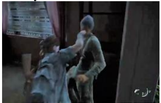
Figure 3. Ellie fighting with a man