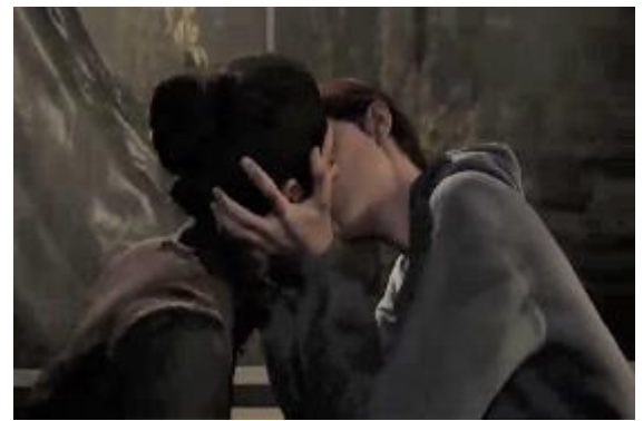
Figure 7. Ellie and Dina Kissing